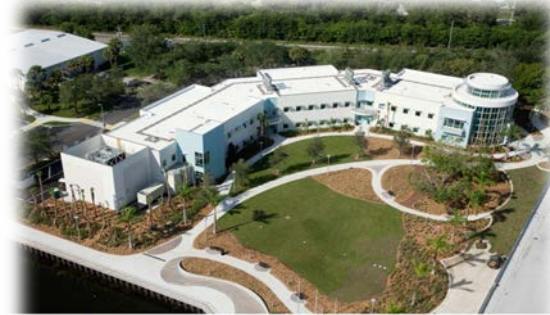
Balfour Beatty Construction