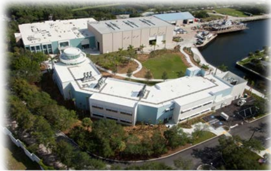
Balfour Beatty Construction