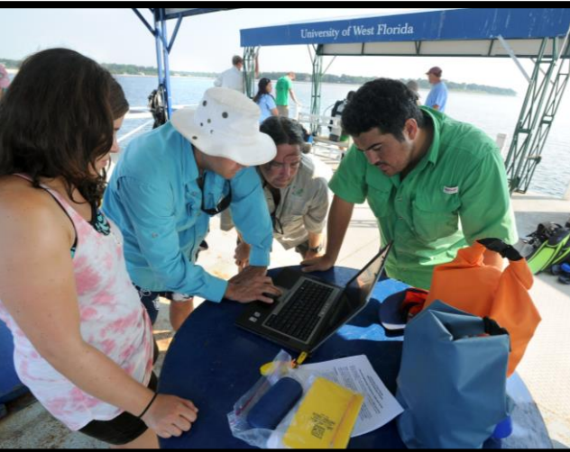
Deepwater Horizon Oil Spill