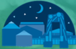
College of Arts, Social Sciences and Humanities