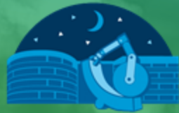
Hal Marcus College of Science and Engineering