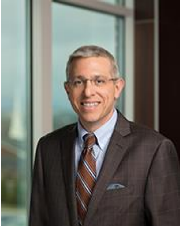
Governor Alan Levine Moderator