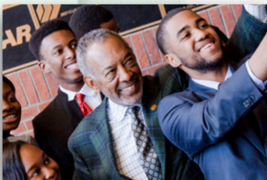
Transformative Alumni, Community and Business Engagement