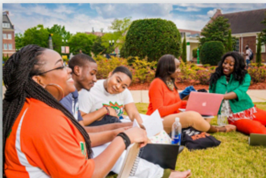
Exceptional Student Experience