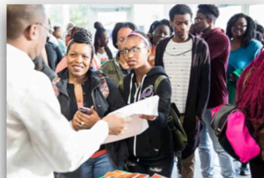
Outstanding Customer Experiences