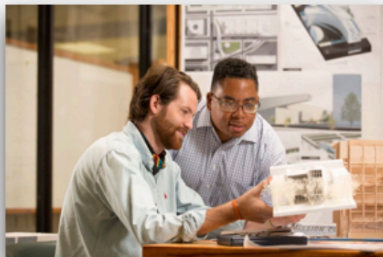
Excellent and Renowned Faculty