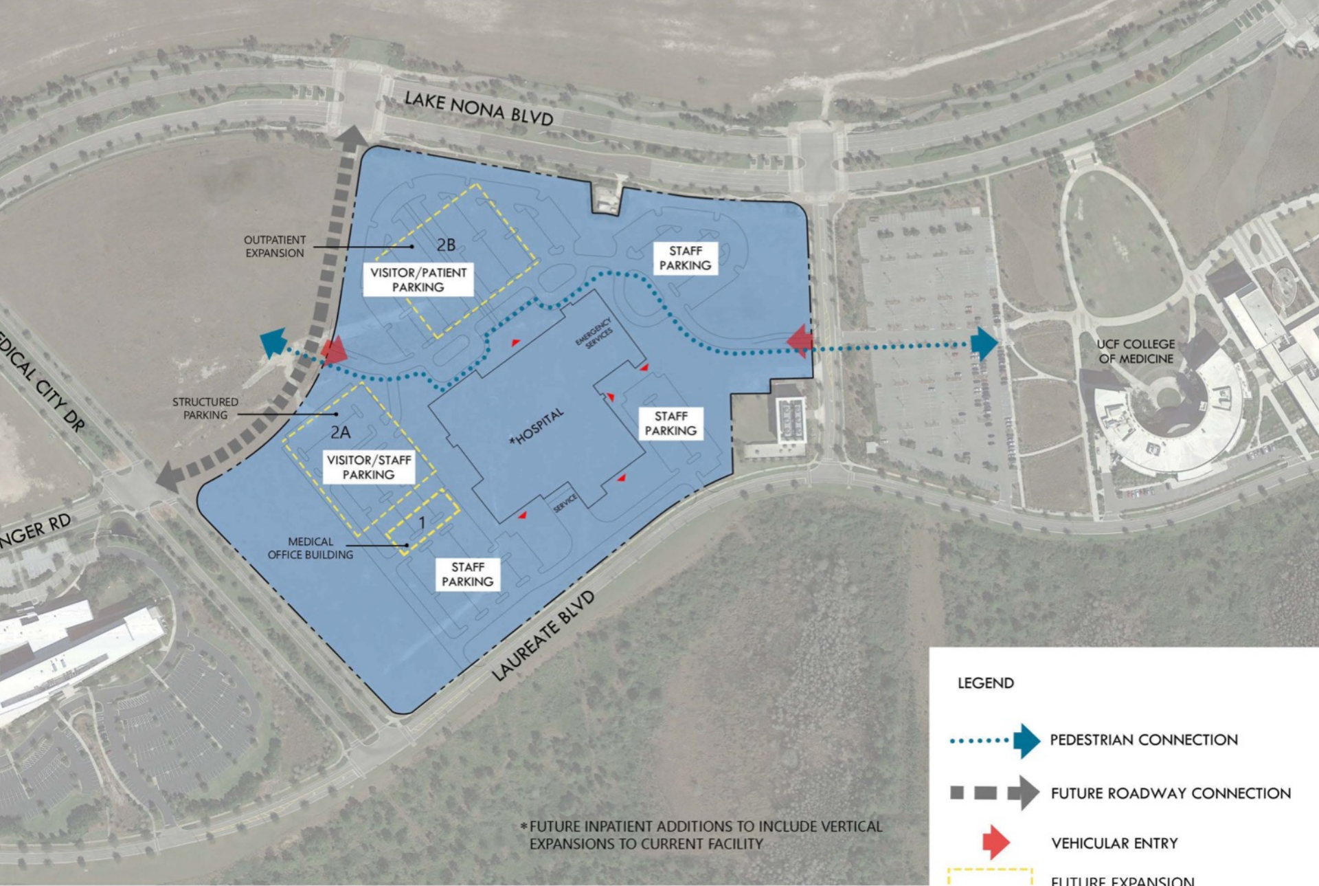
Potential Future Expansion