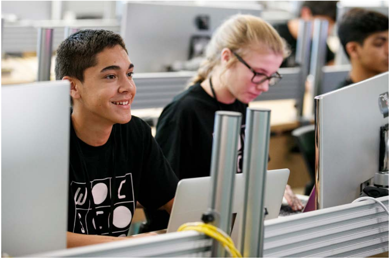
High school students participate in the Cyber Defense Boot Camp, a weeklong summer program launched in July 2016 by FC<sup>2</sup> in partnership with USF Pre-College and the USF Whitehatters Computer Security Club.

In keeping with its mission, the Florida Center for Cybersecurity has made strides in addressing the workforce gap that exists in cybersecurity, and students in Florida are reaping the benefits. The Center is focused on three key areas: