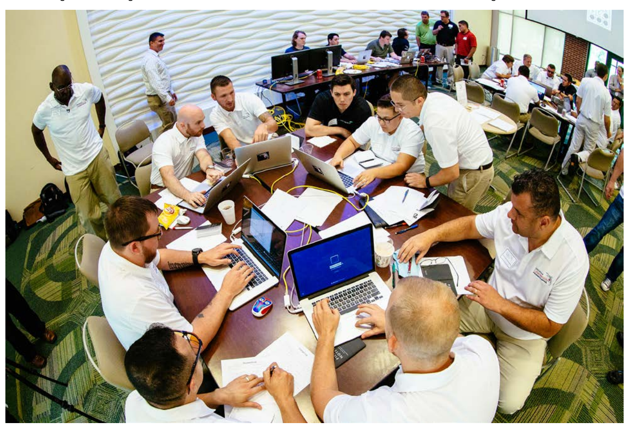
Students who are part of New Skills for a New Fight participate in The Challenge: Cyber Defense on June 17, 2016.