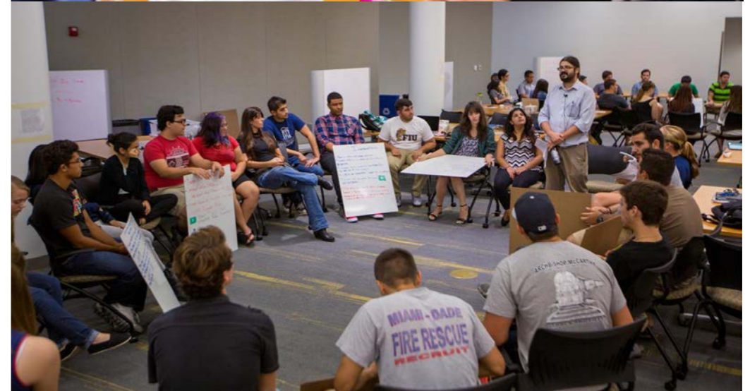
Active Learning Physics Class