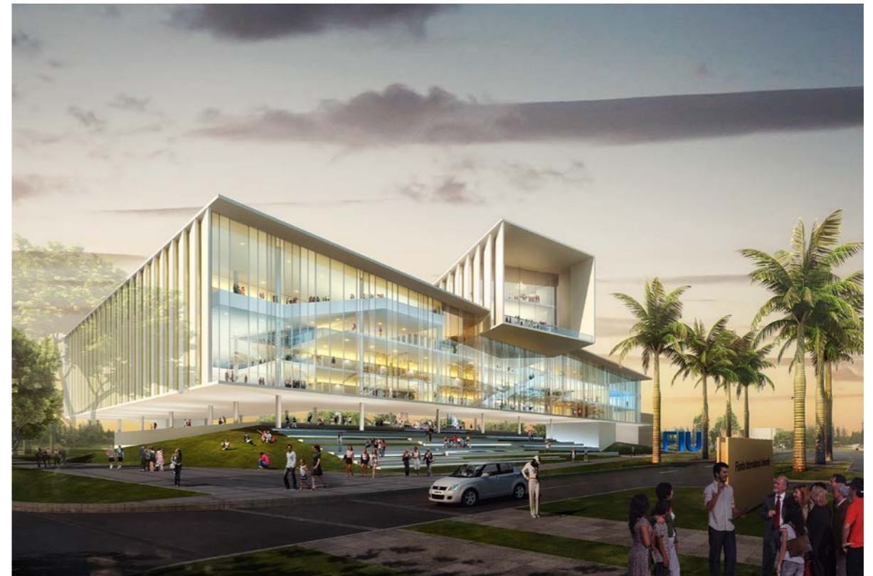
College of Engineering Expansion

Offices, laboratories, specialized media technology and active learning classrooms.