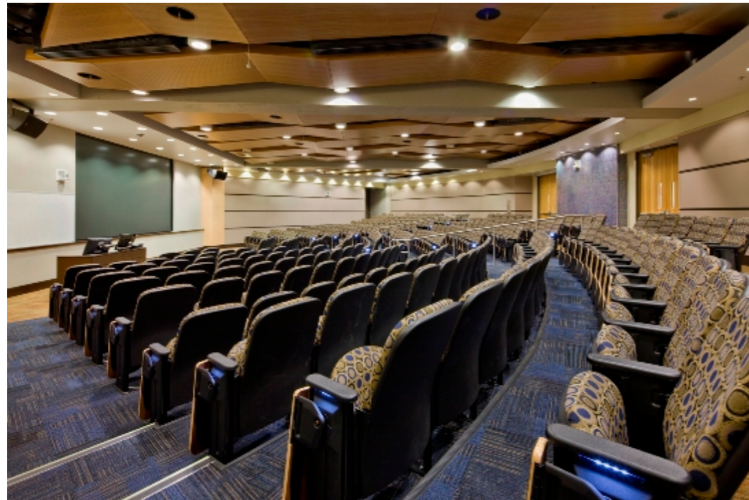
Traditional Physics Class