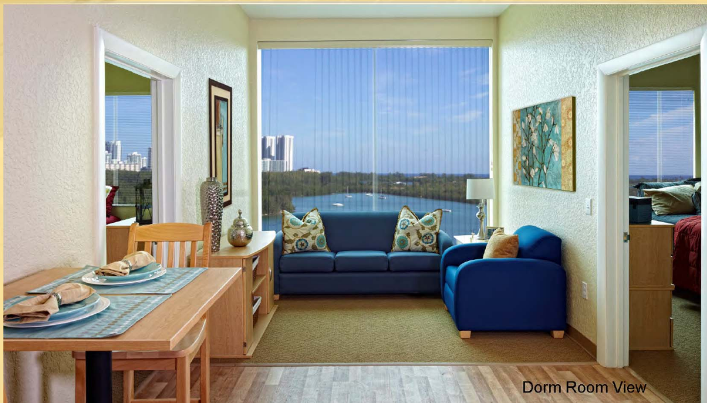
Dorm Room View