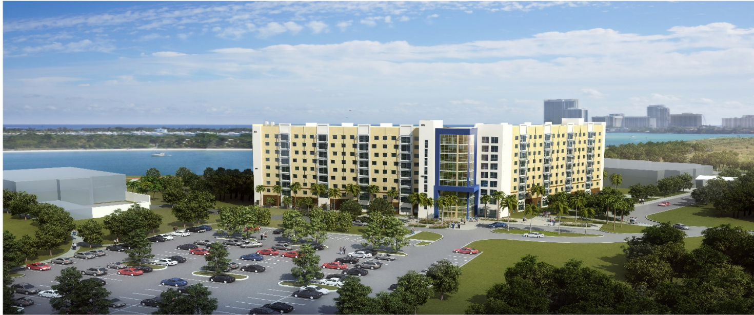
Photo Courtesy: Architect & Landscape SERVITAS KL KALP & LINDEN ARCHITECTS PGAL PGAL GROUP 1000 N. MIAMI AVE. SUITE 1000 MIAMI, FL 33136 WWW.PGAL.COM FLORIDA INTERNATIONAL UNIVERSITY STUDENT HOUSING FACILITY BISCAYNE BAY CAMPUS