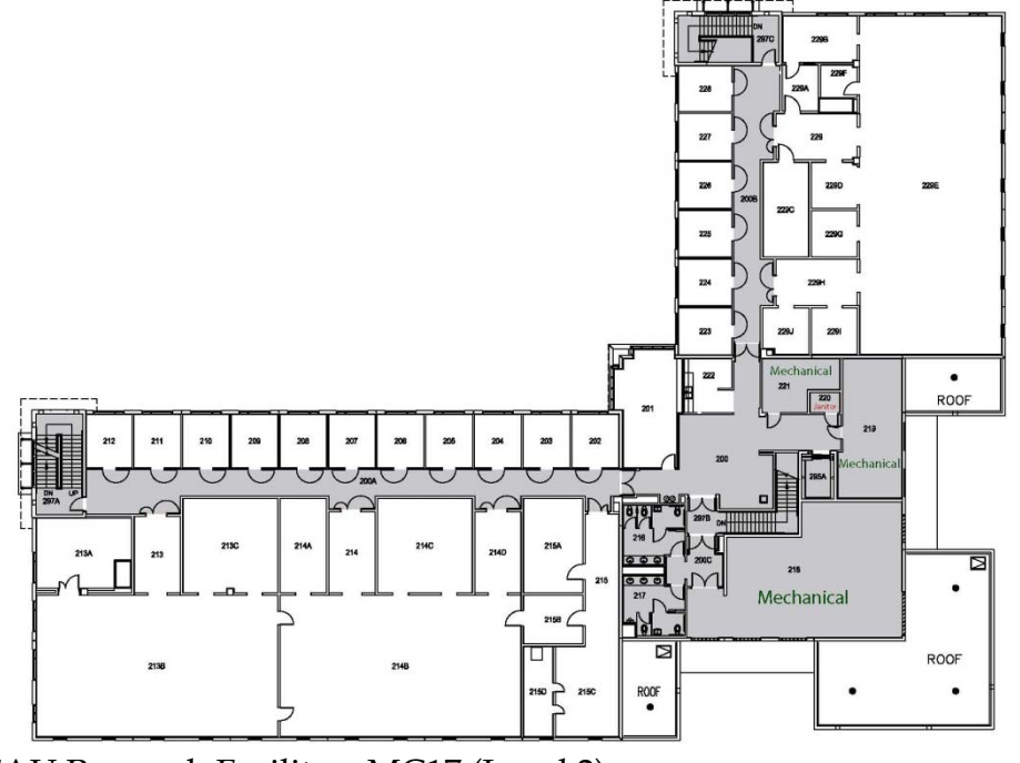
FAU Research Facility - MC17 (Level 2)