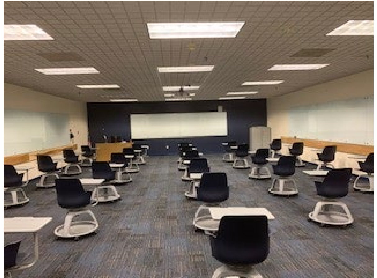
FIU Classroom setup for 6-foot physical distancing