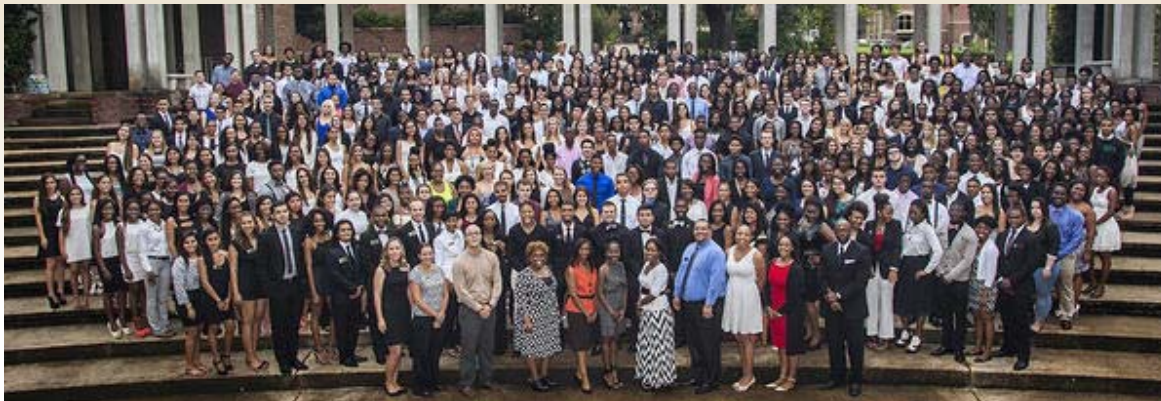
CARE 1st-Year Retention Since 2012