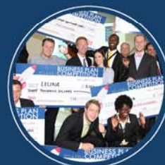
LEADERSHIP, INNOVATION AND ENTREPRENEURSHIP