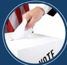
PEACE, JUSTICE AND HUMAN RIGHTS