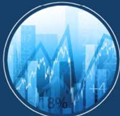
COMMUNITY ENGAGEMENT AND ECONOMIC DEVELOPMENT