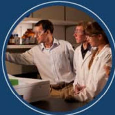
UNDERGRADUATE RESEARCH AND INQUIRY