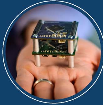
SENSING AND SMART SYSTEMS