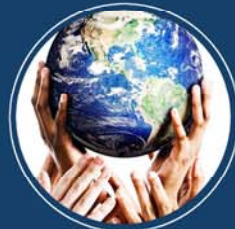
GLOBAL PERSPECTIVES AND PARTICIPATION