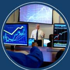
BIG DATA ANALYTICS