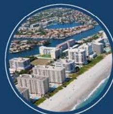
SOUTH FLORIDA CULTURE