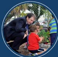
HEALTHY AND ENVIRONMENTALLY SUSTAINABLE CAMPUS