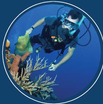
OCEAN SCIENCE AND ENGINEERING/ENVIRONMENTAL SCIENCES