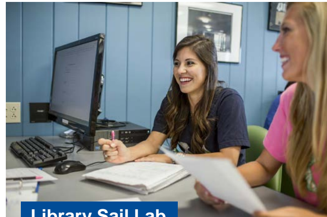
Library Sail Lab