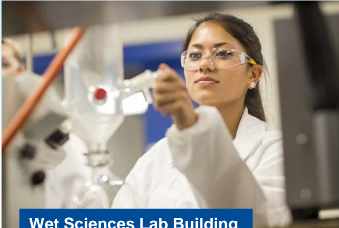
Wet Sciences Lab Building