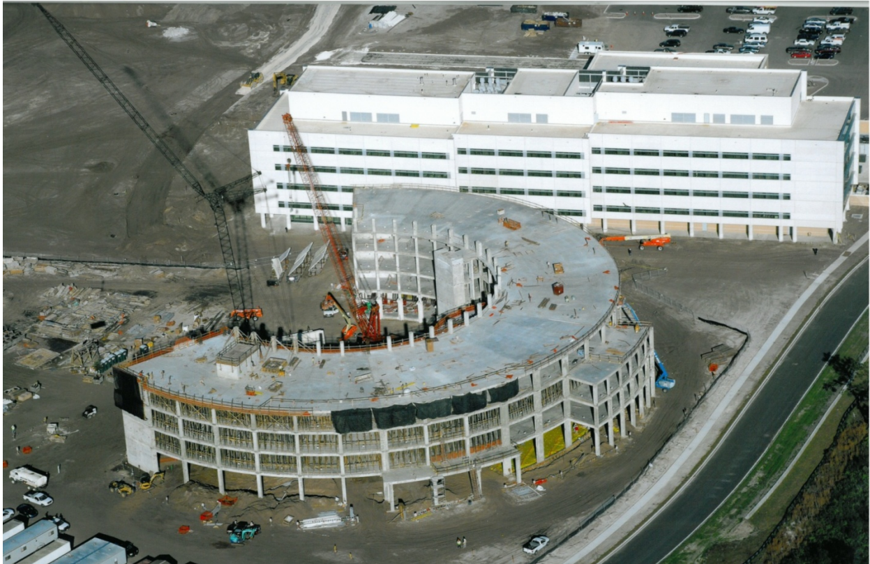
UCF College of Medicine Buildings Under Construction at Lake Nona February 2009 Medical Education Building (front) and Burnett Biomedical Sciences Building (back)